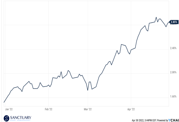
10 Year Treasury Rate

Jobs Jobs Jobs: Economists forecast a gain of 375,000 jobs in nonfarm payrolls, compared with an increase of 431,000 in March. The unemployment rate is expected to remain unchanged at 3.6%, near historical lows. The labor market remains tight, as job openings continues to outpace job seekers.